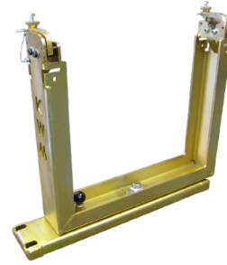
▷ TURNSTILE UPRIGHT