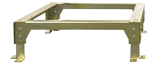
▷ TRAILER RISER PADS

When purchasing your next gutter machine at Buchner Manufacturing, you will receive the best warranty possible! 4-year parts and labour/mechanical and 1-year parts and labour/electrical.