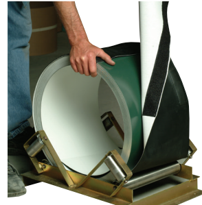
▷ COIL COVER