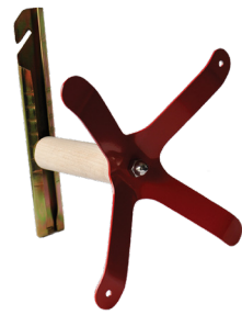
▷ TROUGH MATE