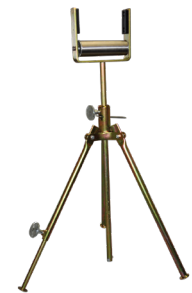
▷ TROUGH RUN OUT STAND