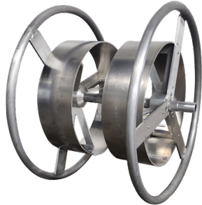
▷ STOCK REEL